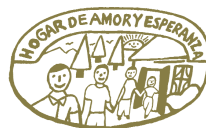
Photo above: Work teams are helping with construction at Amaratteca.

El Hogar Ministries, Inc. 70 Church Street Winchester, MA 01890