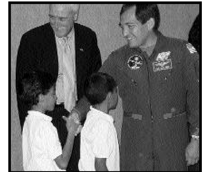
NASA Director, Sean O'Keefe introduces astronaut to El Hogar boys

As if that wasn't enough excitement for one week, twenty-five of the boys received the privilege of going to the National Museum in Tegucigalpa to witness Sean O'Keefe, acting on behalf of the President of the United States, as he presented a moon rock to the President of Honduras. The moon rock is now part of the Museum's permanent collection. How many boys can say they spent time with the Director of NASA, a real astronaut, the Ambassador to Honduras, and the President of Honduras, all in one week - much less ever in their lives? Our special boys are honored and grateful for the attention of these special people, and were given wonderful memories that will stay with them for a lifetime.