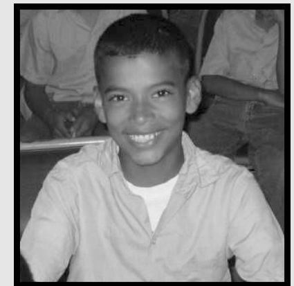
Another of God's beloved children

One of the blessings of being part of a work team is that one-on-one visits with sponsored boys can bring their relationship to life - for both the sponsor and the boy - and each can see the face of Christ in the other.