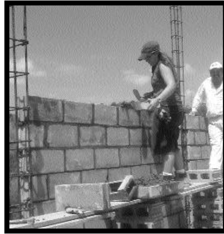
Left to right: Bathhouse and laundry facility, floor and wall structures for workshop, Constructing workshop walls