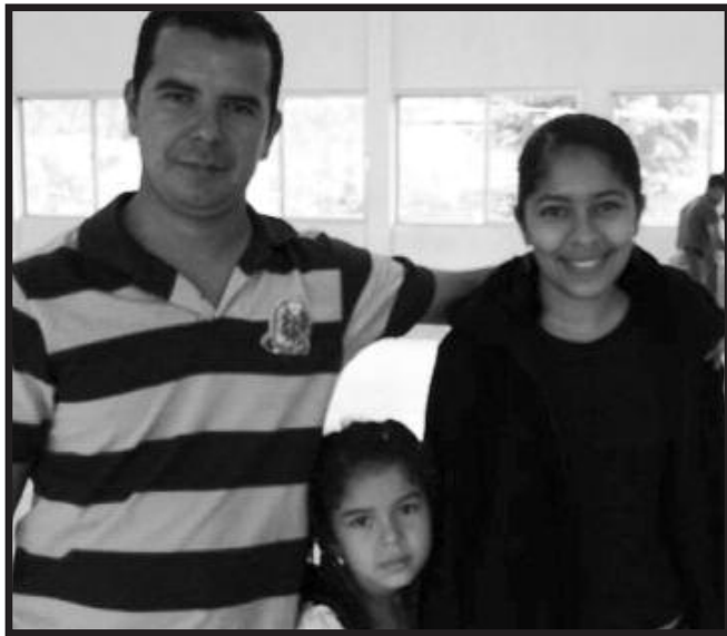
El Hogar alum with his young family