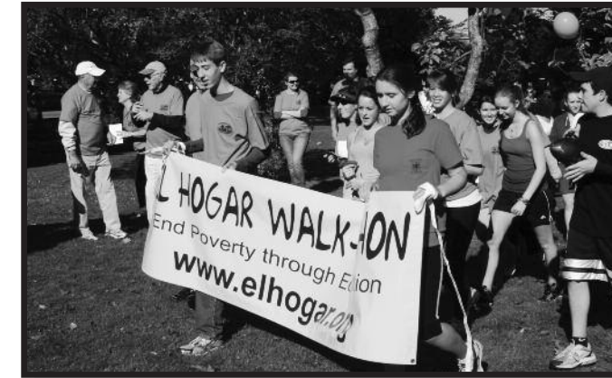
Our Winchester, MA walk attracted many enthusiastic participants.

The annual El Hogar Walkathon is designed to take place all around the country. This being our pilot year, we had two areas participate, one in Colorado in June and one in Massachusetts in October. These two walks together raised over $30,000! Imagine if each year five additional sites host a walk; the contribution to El Hogar could be huge! Walkathons are ideal fundraisers because they have very few expenses and almost all the