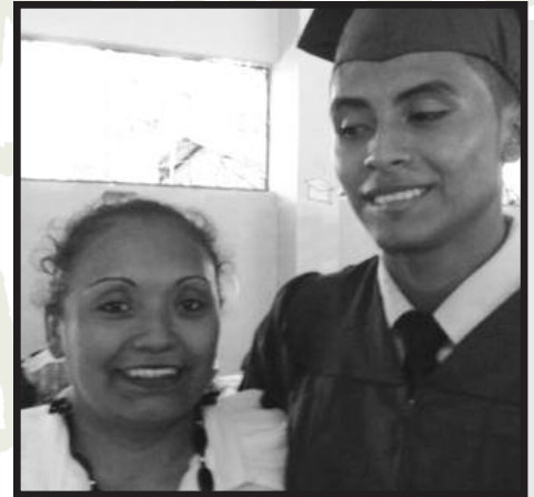
Recent graduate with his proud mother

El Hogar Projects Apartado Postal 764 Tegucigalpa, DC, Honduras