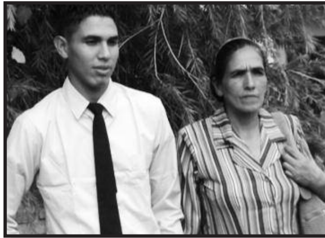
Farm graduate and his mother